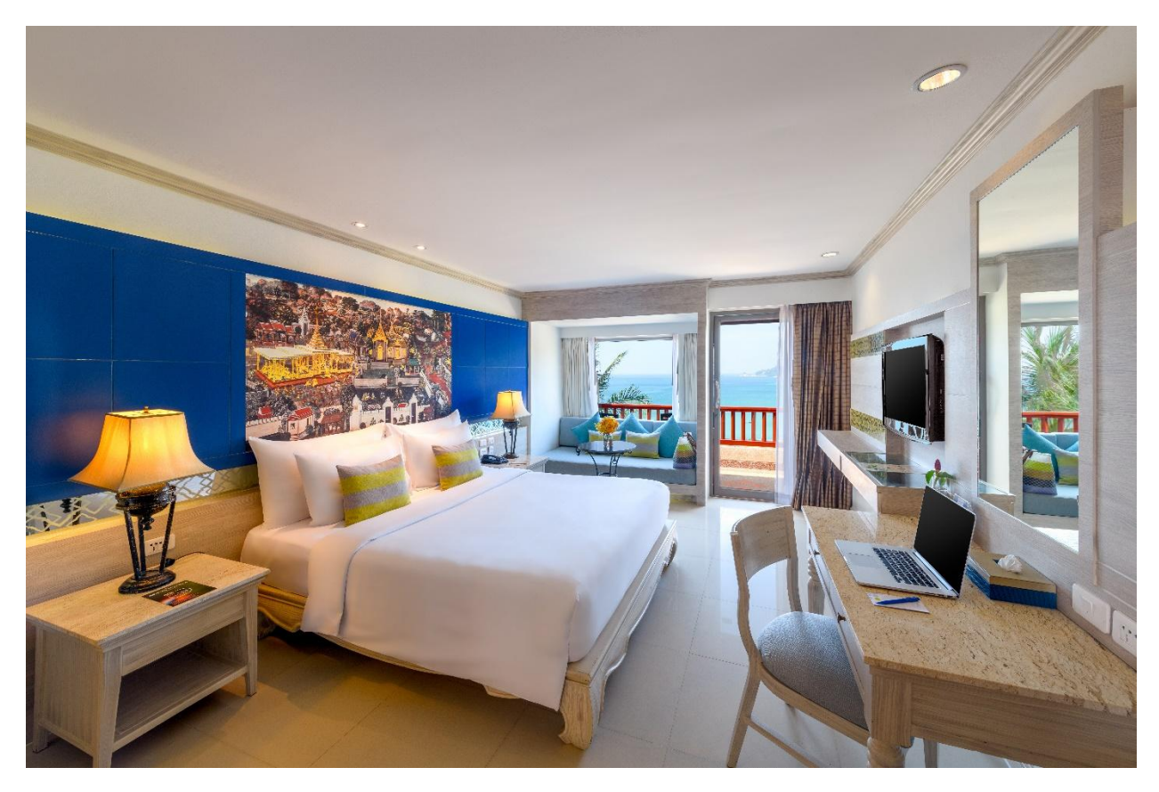
Guest rooms at Novotel Phuket Resort are quiet and well appointed.

The tournament playing room is accessed by a short walk up a steep hill. Although players are welcome to undertake this climb by foot if they so prefer, a continuous tuk-tuk shuttle service will operate from the base of the hill from 30 minutes before each round.