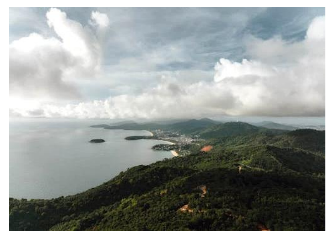
Patong Beach is the most central of the three beaches pictured.