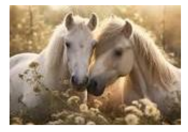
No need to fight if you don't want to.

An offer of a draw may be ventured at any time, without requirement for a specific number of moves to have been made.