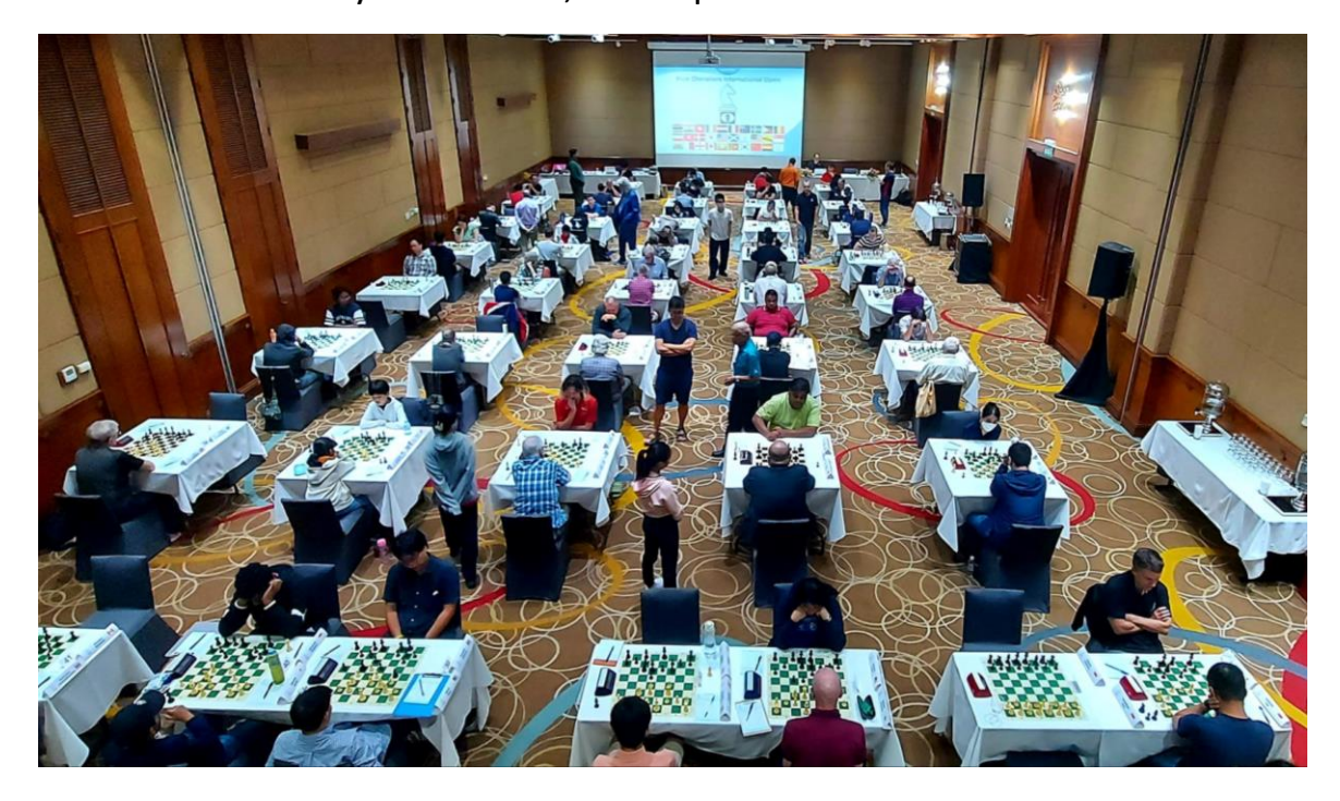
Trophies and Medals

Winners of cash prizes not exceeding 5,000 baht must be present at the presentation ceremony to collect it, or the prize will be forfeited.