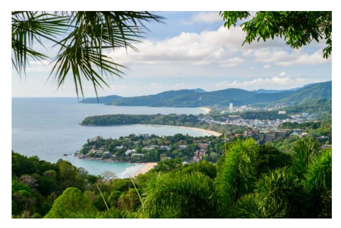
Patong Beach sits between ocean and hilly jungle