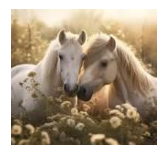
No need to fight if you don't want to.

An offer of a draw may be ventured at any time, without requirement for a specific number of moves to have been made.