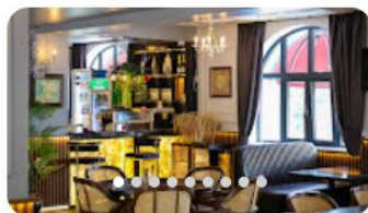
PREMIUM Hotel, Mediterranean Food & M... from €49 4.6 ★★★★★ (119)