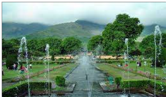
Mughal Garden (5 KM)