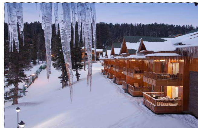
Gulmarg (45 KM)