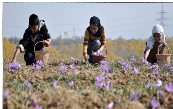
Saffron Land (10 KM)