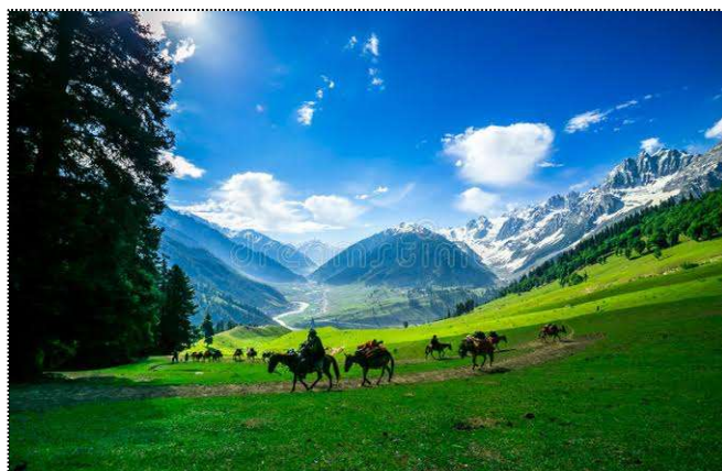
Pahalgam (90 KM)