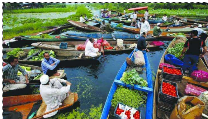
Dal Lake Floating Market (3 KM)

(Approx. Distance From Tournament Venue)