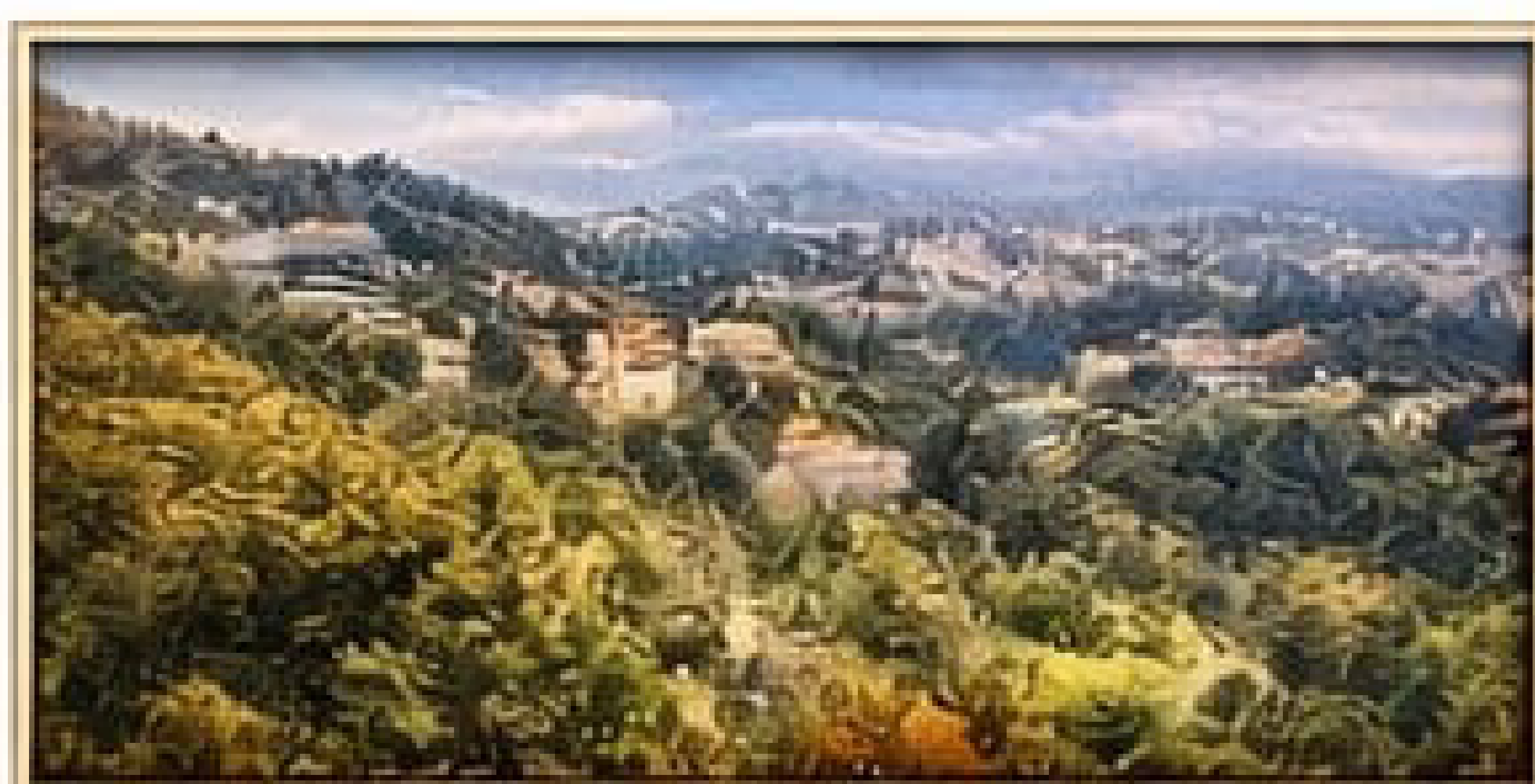
Day Trip to Mussoorie