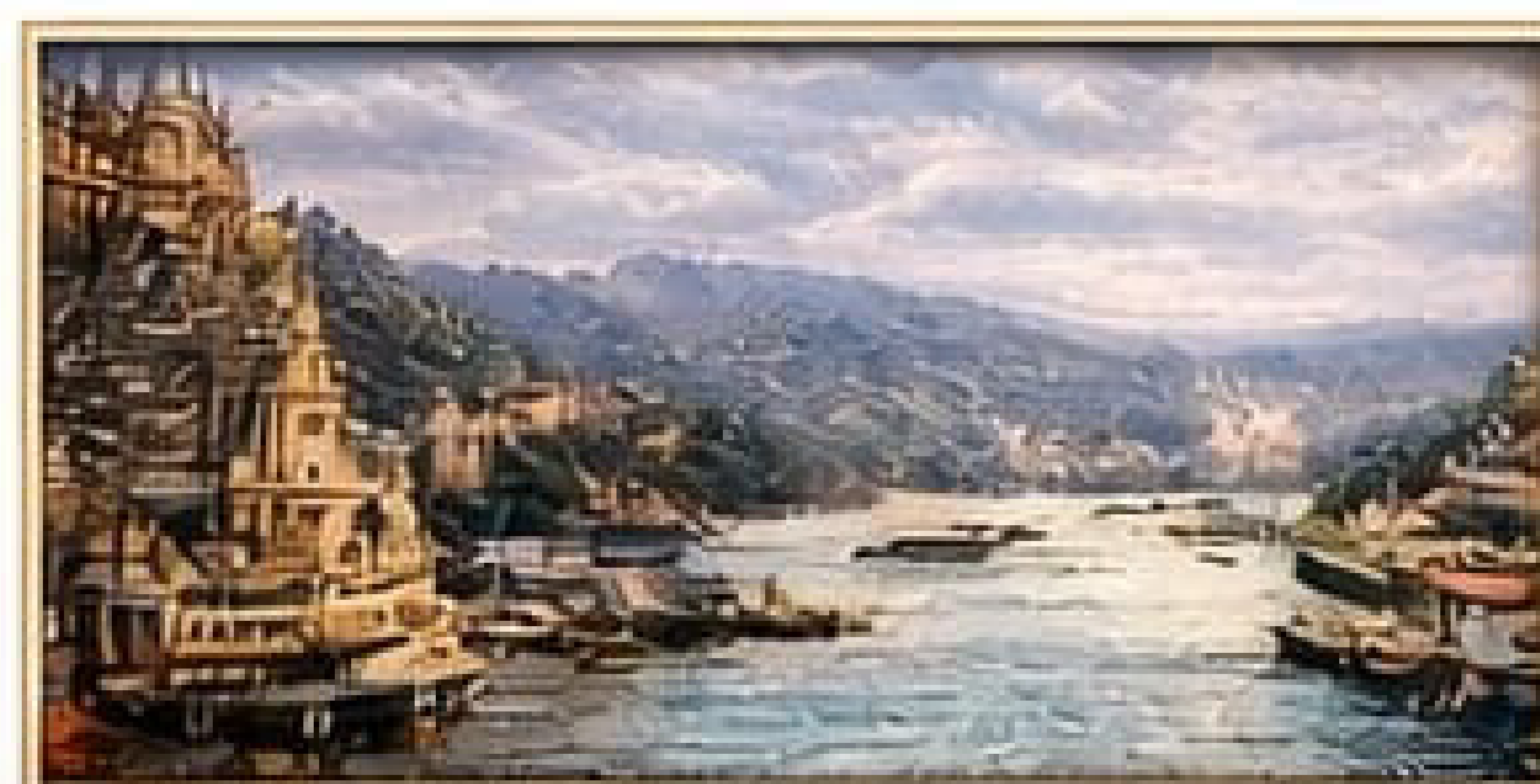
Day Trip within Dehradun