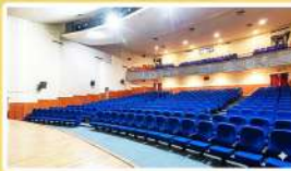
Parents' Sitting Area