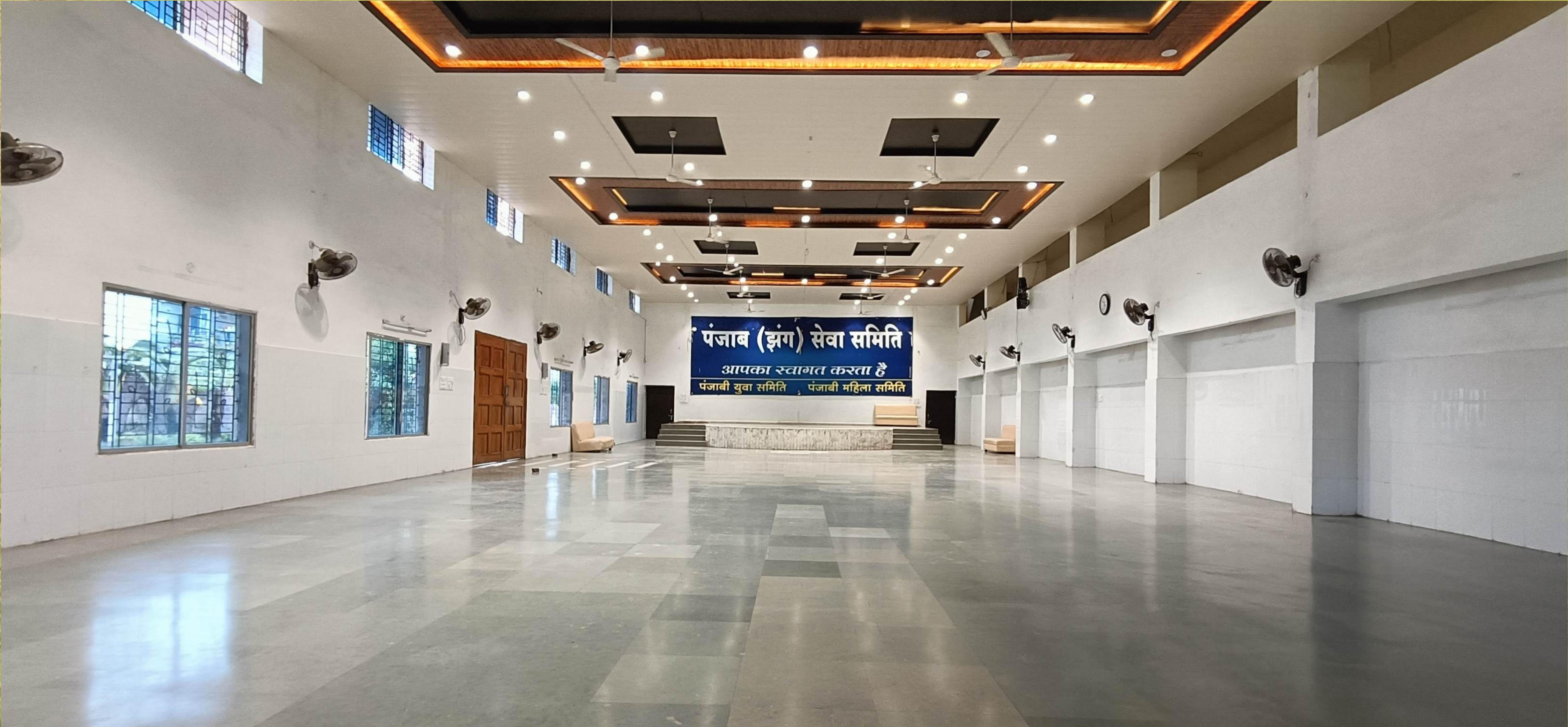
Playing Hall With Fully Air conditioning & Playground for Kids