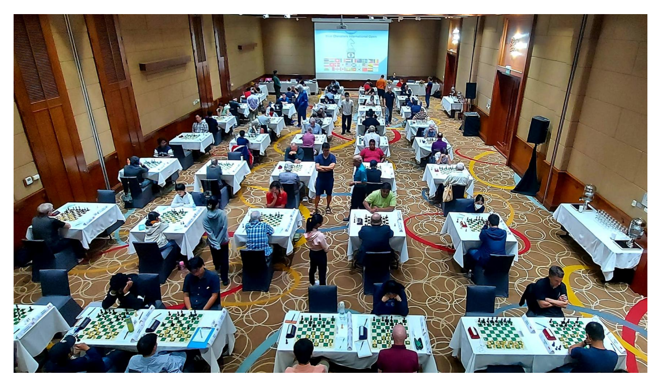
Trophies and Medals

Prizes will not be shared. Ties will be broken by applying the tie breaking procedures indicated on the tournament's page at chess-results.com.