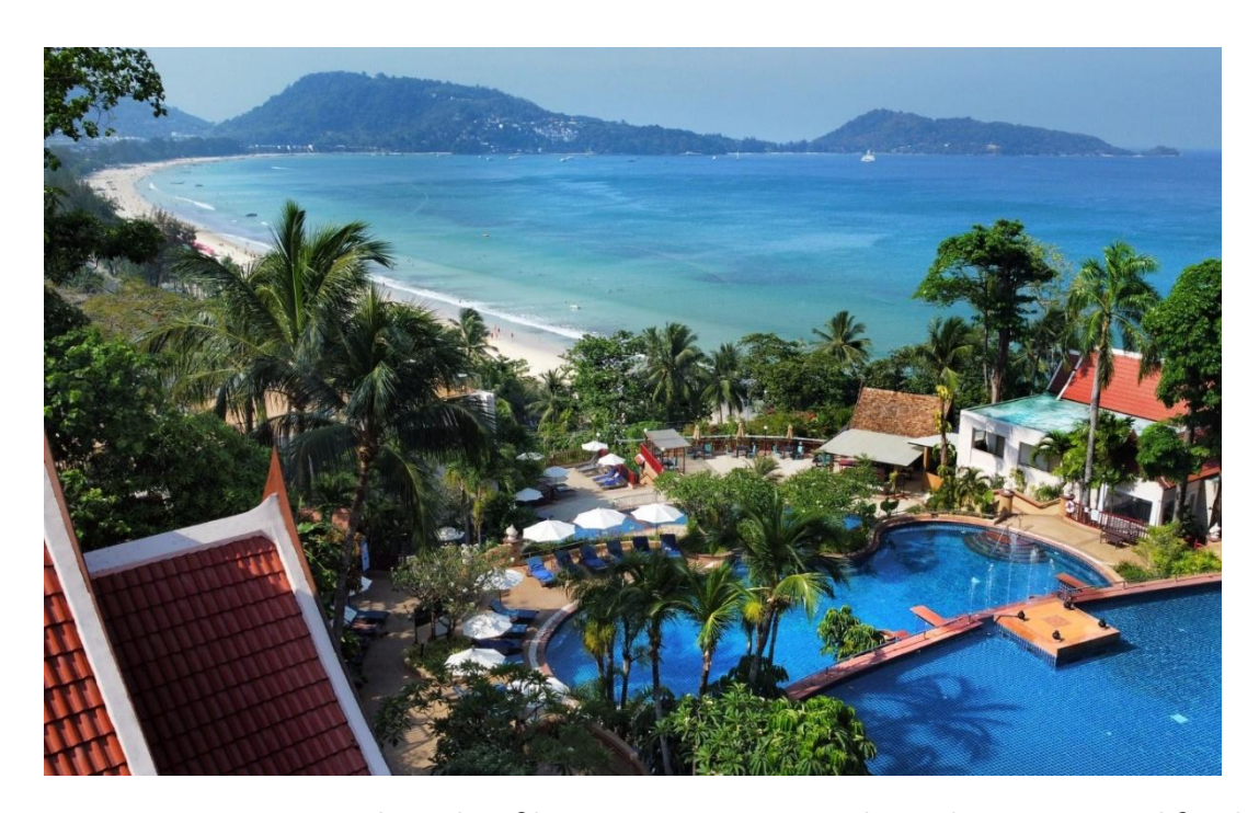
Resort guests enjoy a multitude of bars, swimming pools and recreational facilities

Novotel Phuket Resort is nestled in a quiet corner of Patong Beach. The tournament will be played at the "Siam Conference Centre" within the resort.