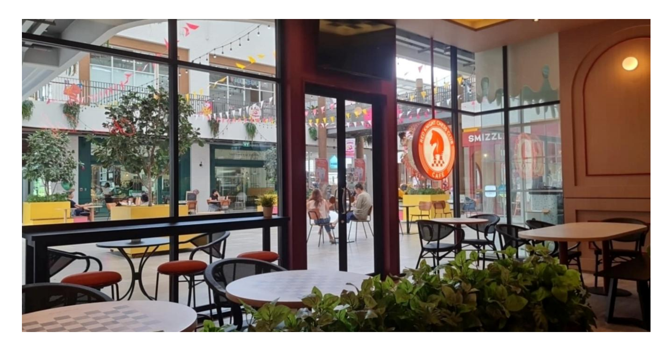
In August 2024, the Red Knight Chess Café was opened. With a new, modern design, this chess themed coffee shop is a must-stop place for chess players from all around the world, when visiting or passing through Bangkok.